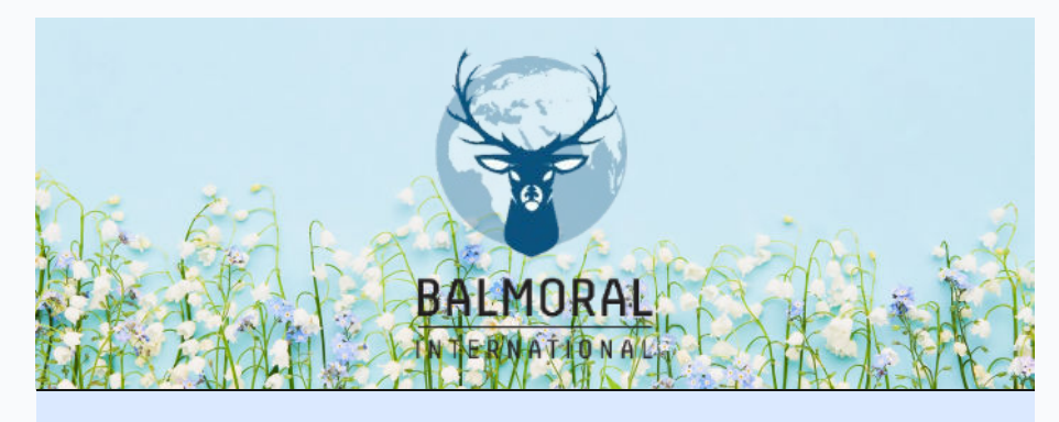
<u>Our news - May 2022</u>